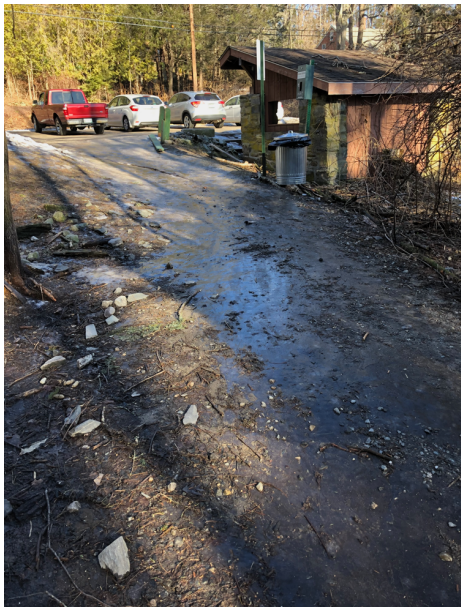
Existing icing at Winnick Woods Trailhead

• Winnick Woods Parking lot Closed for repairs. The Winnick Woods Parking lot located on Sawyer Road will be closed the beginning April 29th so that repairs to the parking lot and trail head can be made. Please avoid the area during the closure. Any frequent user of the parking lot knows that icing conditions and erosion is due to be addressed. The parking lot will be regraded to direct stormwater to the existing swale located next to Sawyer Rd. The trail head, which can become treacherously icy, will have water bars installed to direct water off the trail. Both improvements have been recommended by the Cumberland County Soil and Water District and should be completed in 1-2 weeks, weather dependent.