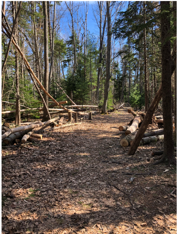
Great Pond Trail: Trail cleared of significant tree blow downs.

• Chainsaw Heros still wanted. Our trail maintenance person is working his way around the greenbelt clearing trees that have fallen on the trails. Complicated tree removals are underway by the Tree Warden. Anyone who is comfortable helping him out with fallen trees is welcome to join our honorary Chainsaw Heros Club . To join, please safely remove any portion of a tree that is on a greenbelt trail.